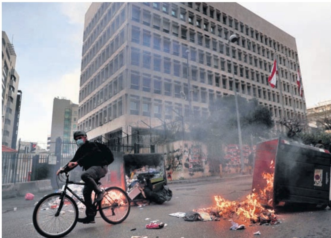
In this Monday, March 22, 2021, file photo, a man rides his bicycle past garbage containers set on fire by protesters blocking a main road in front the Lebanese Central Bank building, background, in Beirut, Lebanon.

The World Bank said that since late 2019, Lebanon has been facing compounded challenges, including its largest peacetime economic and financial crisis, the spread of coronavirus and a massive blast at Beirut's port last year that is considered as one of the largest non-nuclear explosions in history. The crisis has worsened in recent months amid a paralyzing power struggle between the president and prime minister-designate that has delayed the formation of a new government. The Cabinet of outgoing Prime Minister Hassan Diab resigned days after the Aug. 4 blast, and the country has been without a fully functioning government since. The explosion in the Port of Beirut killed 211 people, wounded more than 6,000 and damaged